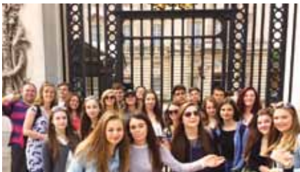
London Theatre Stage craft and a trip to see Charlie & the Chocolate Factory