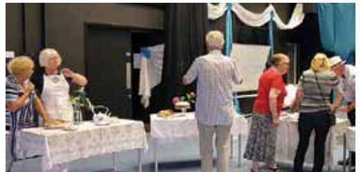
Bake-Off After days of trial and error, the students' cakes were judged by local experts