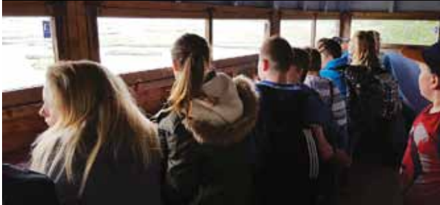
Ecological Studies A varied week studying fossils and rock pools in Kimmeridge, then birdwatching and pond-dipping in Arne