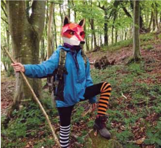
Woodland Art Students made masks for a photography project in the woods at Rempstone then joined craftsman Toby Hoad to work with green wood and help him make charcoal