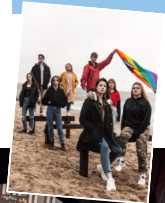
The cast of 'Dungeness' at the Mowlem Theatre last year

Wizard of Oz news: Sadly we have had to postpone our 2021 annual school production as rehearsals are not practicable at present with the Covid mitigations we've got in place. We will do all we can for the show to go on at a later date!